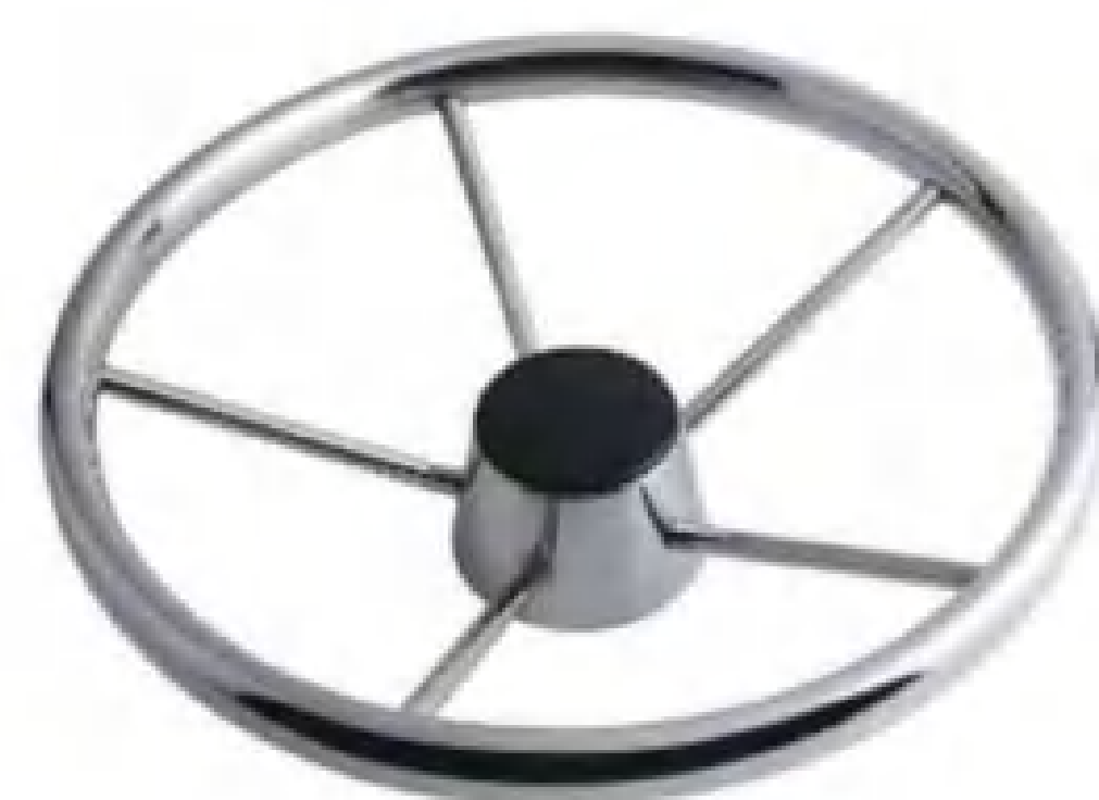
AISI316/304 STAINLESS STEEL STEERING WHEEL 316/304不锈钢方向盘