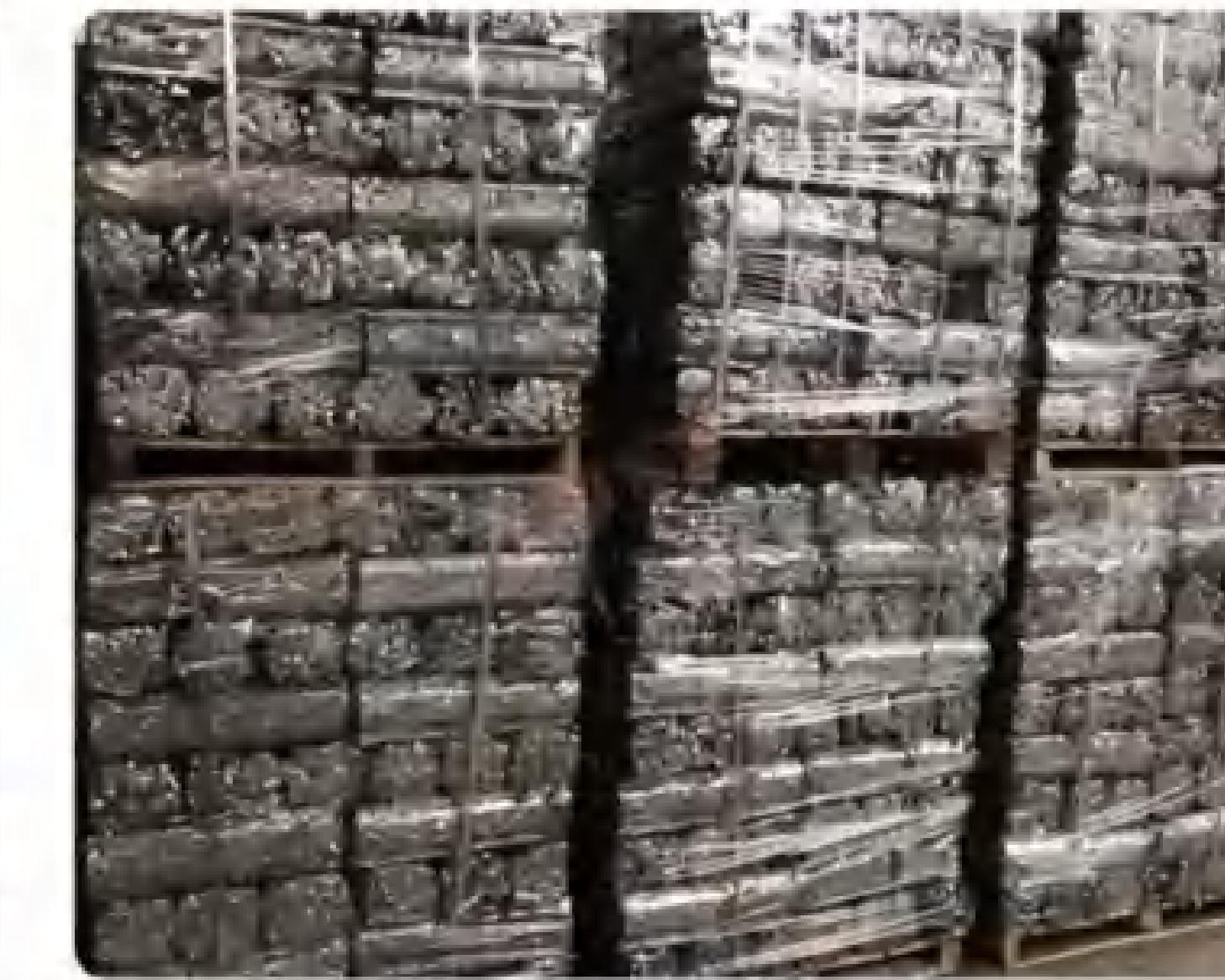
Marine grade raw materials