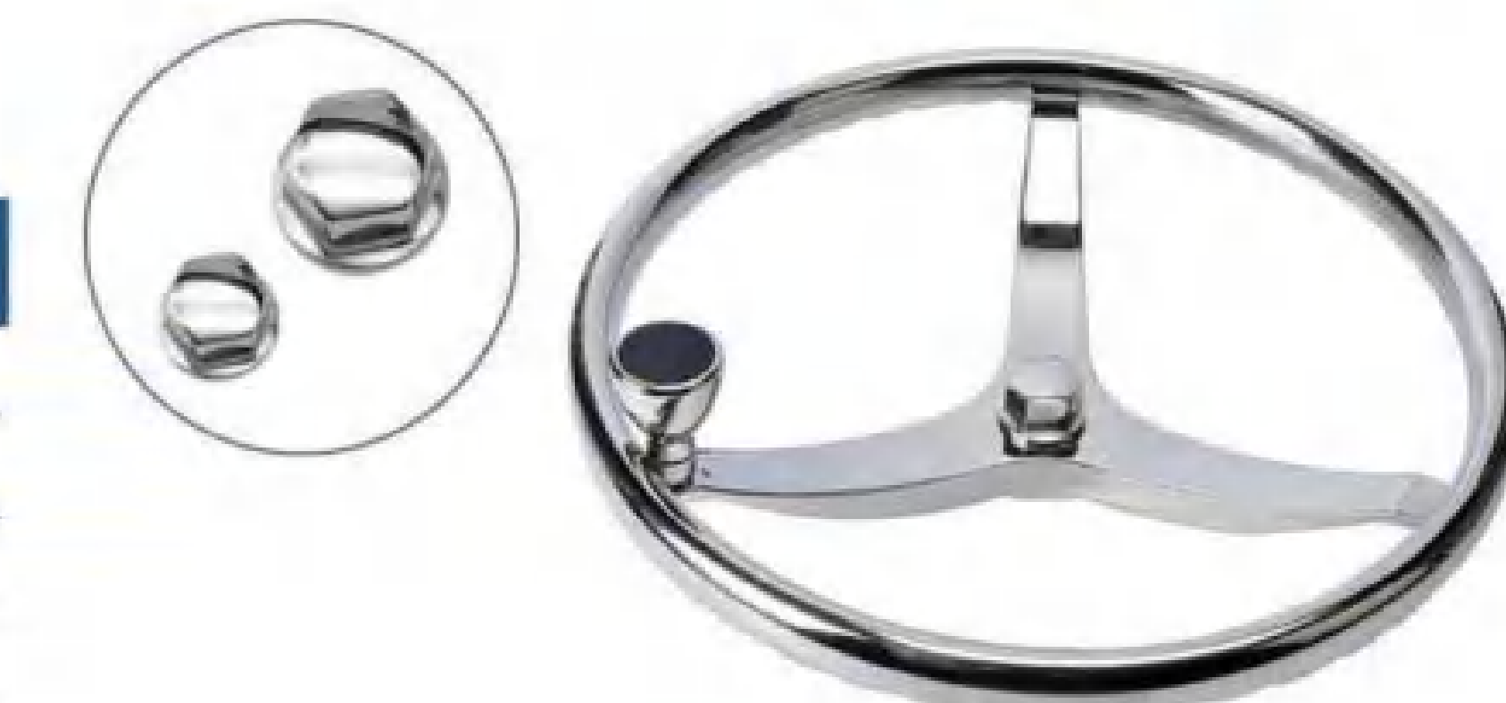
AISI316/304 STAINLESS STEEL STEERING WHEEL 304/316不锈钢方向盘