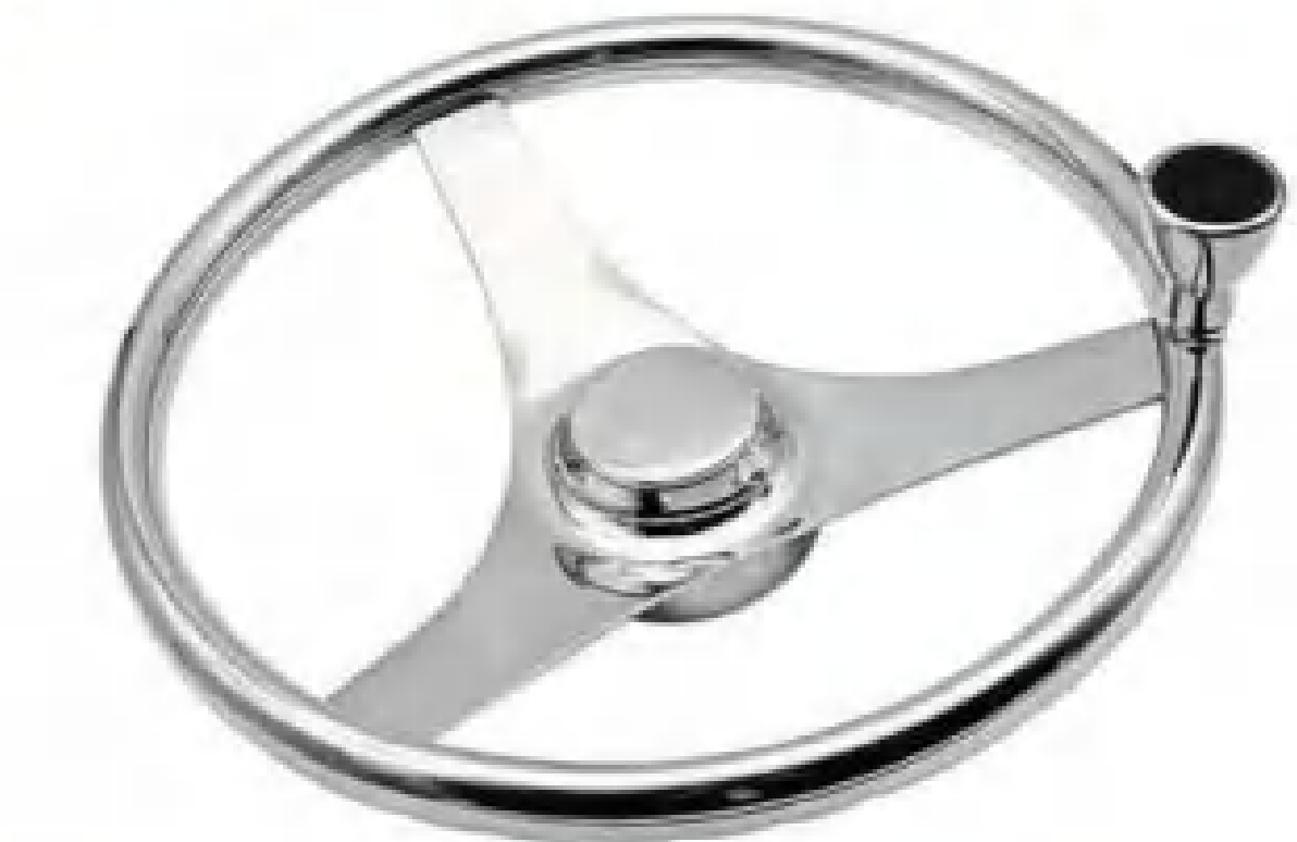
AISI316/304 STAINLESS STEEL STEERING WHEEL 316/304不锈钢方向盘