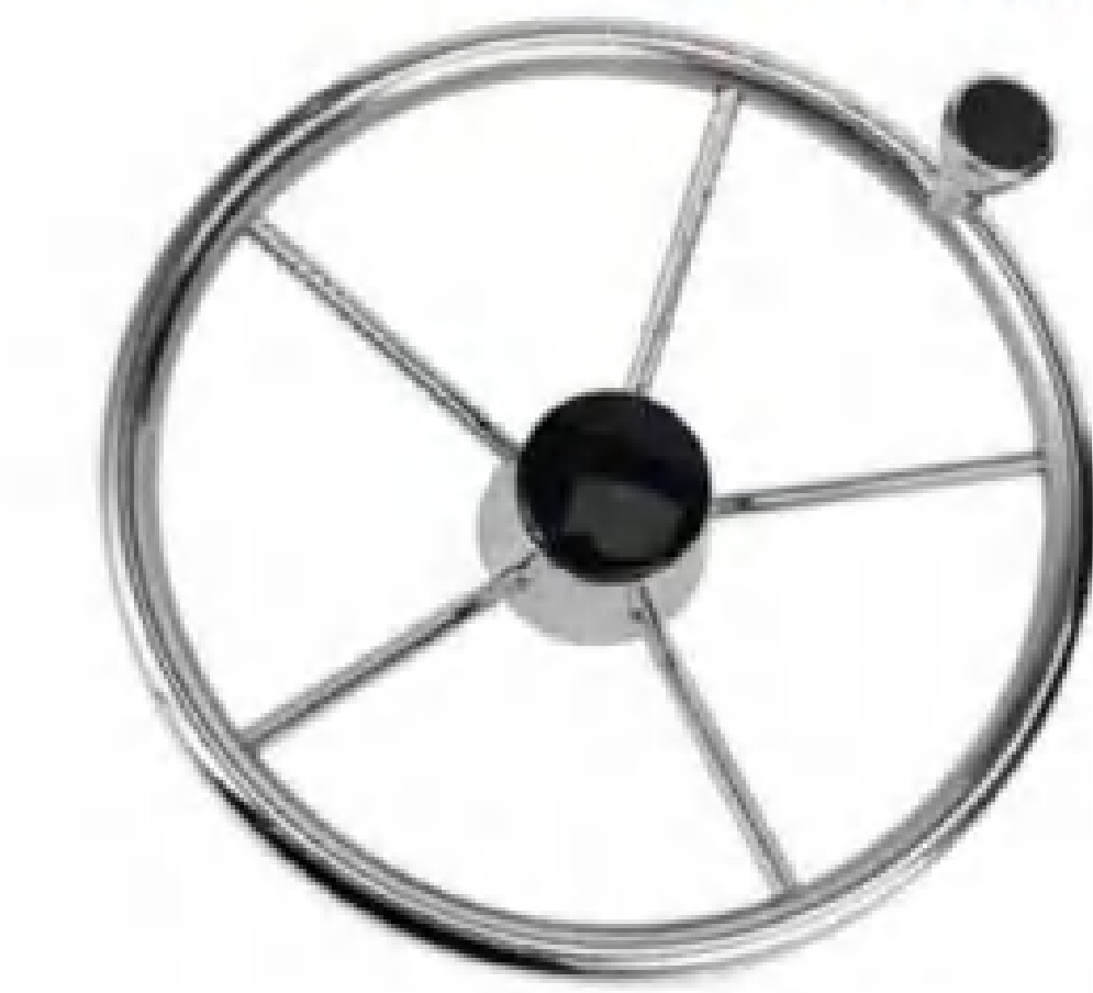
AISI316/304 STAINLESS STEEL SPORT WHEEL W/FINGER GRIPS & CONALSOL KNOB 316/304不锈钢运动车轮带把手方向盘